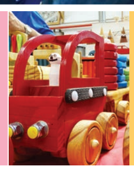
Open Day Toy & Craft Sale Saturday 25th November 17