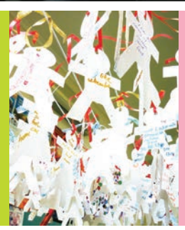
Listening@ Lakemba Forum and Lunch P12